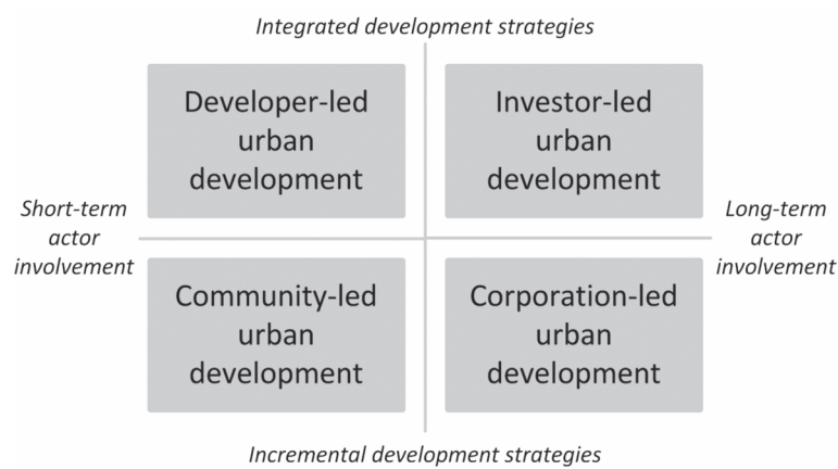
Figure 9.3 Typologies of private sector-led urban development